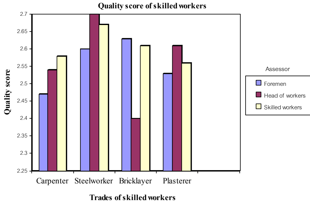
Figure 1: A comparison of skill workers' quality

To summarize the above, Figure 1 presents the workers' quality of the four selected trades assessed by foremen, head of workers and skilled workers. The workers' quality could be considered in between good and fair with the average quality score of 2.57 for all trades studied. The average score assessed by the skilled workers themselves is slightly higher than that assessed by foremen and head of workers, however, it shows no distinct difference.