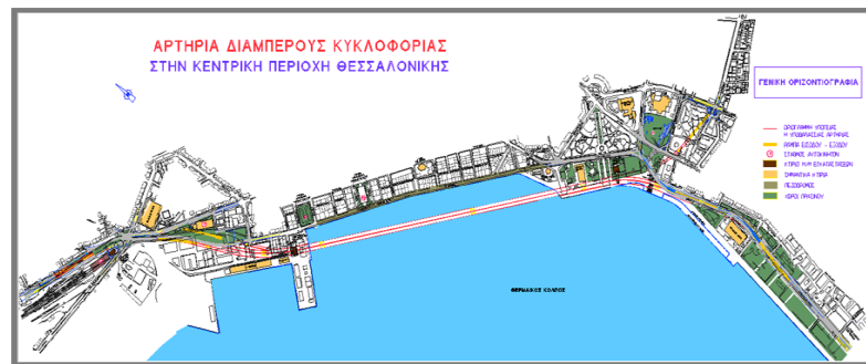
Figure 1: Road layout of the first design concept of the Underwater Artery

The road layout of Solution 1 provides a new link between the Western Entrance of Thessaloniki and Megalou Alexandrou Avenue, bypassing the city center partially underground but mostly underwater. More specifically, the Artery will start from Koletti Street at the Western Entrance of the city and then, near the building of the Administrative Court of Thessaloniki it will proceed underground, heading south-eastwards. Thereafter the Artery will run through the Gulf of Thessaloniki in the form of an underwater tunnel alongside the seafront, at a distance of 80-120 m. away from it. The tunnel will emerge eventually at street level right after the “Makedonia Palace” Hotel, joining into Megalou Alexandrou Avenue (where the tunnel exit is located), until the Artery ends at the junction with P. Syndika Street.