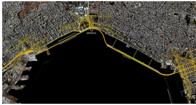
Figure 2: Road layout of the second design concept of the Underwater Artery