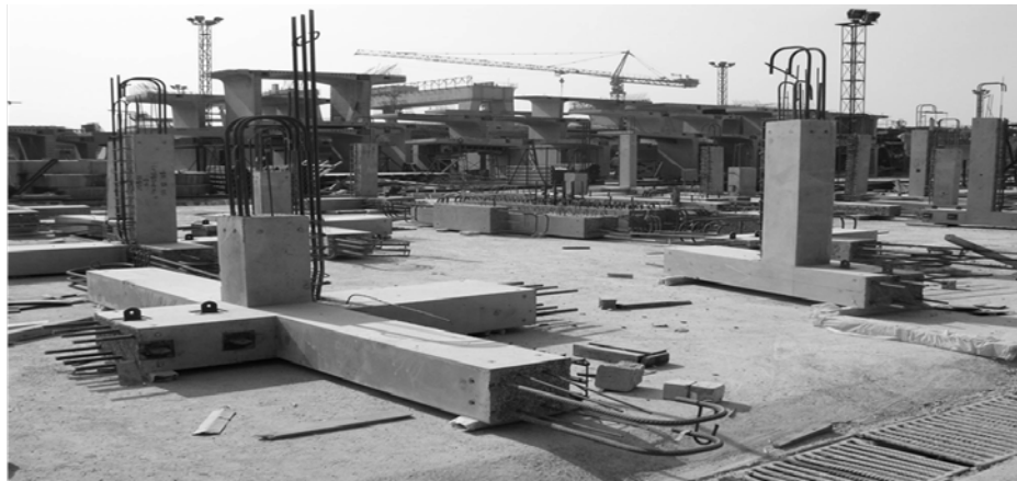
Figure 2: Building elements of all scales and complexities are fabricated from the BIM process at precast factories in China (Girmscheid, 2011)