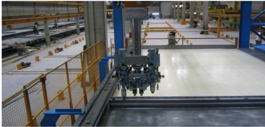
Figure 5: Formwork robot – Placing Side Forms (Girmscheid, 2011)

The application of technology in the international construction level is developing rapidly. Nevertheless, there is a rising concern on the uptake of technology use and its area of sophistication in which we should study. Hence, the following section elaborates in the e-readiness for IBS components management in Malaysia.