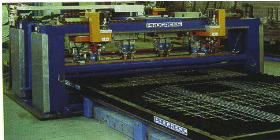
Figure 4: Reinforcement Cage – Welding & Assembling Robot (Girmscheid, 2011)