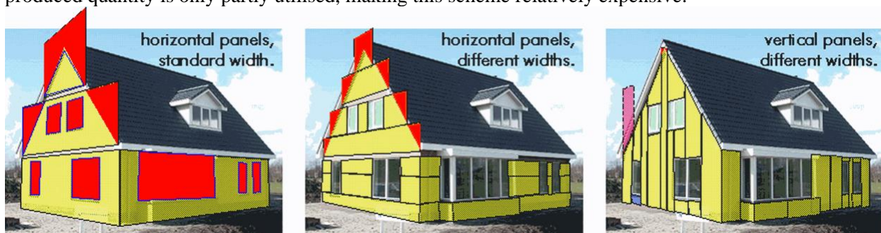
Figure 1: Feasible set-ups for full industrially produced walls. Set-up right is adopted in this study.

The aim is to develop industrial parts for house building. Since INDUSTRIAL implies mass-production, available from stock , unknown of specific project-requires (whereas PREFABRICATION implies specific production elsewhere, made to order ) some waste seems to be unavoidable when making a pre-defined plan. Figure 1 shows three schemes for assembling façades out of standard panels with regard to left over material. The sketch on the left refers to timber frame building with prefabricated elements of floor height (platform construction). This method is advantageous when prefabricated, but projected on panels of standard width there can be up to 30% waste direct after production. Dark areas in the sketch (in corners and for openings) indicate wastage when this façade is cut out of base elements. An industrial building system that goes by this sketch is called SIP's (Structural Insulated Panels). This system uses industrially produced elements made of two large OSB sheets with rigid insulation glued in between. A high percentage of residues when using SIP's confirms that this scheme is not consistent with the basic principle in our research regarding care of environmental consciousness. Another reason to minimize residues is that produced quantity is only partly utilised, making this scheme relatively expensive.