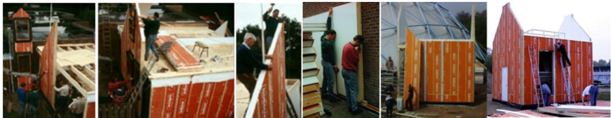
Figure 3: Practical projects to study details of walls with just 5% of vast material in real practice.

Developing airy panels makes no sense if panels at the end cannot be used in real details. Therefore two trial-projects are realised in an early stage. Various details are tested by practical experience for instance in a workplace (4 photos left in figure 3) with partly a flat roof and also a pitched roof. A laboratory building (2 photos right in figure 3) is mainly set up to study construction with large panels.