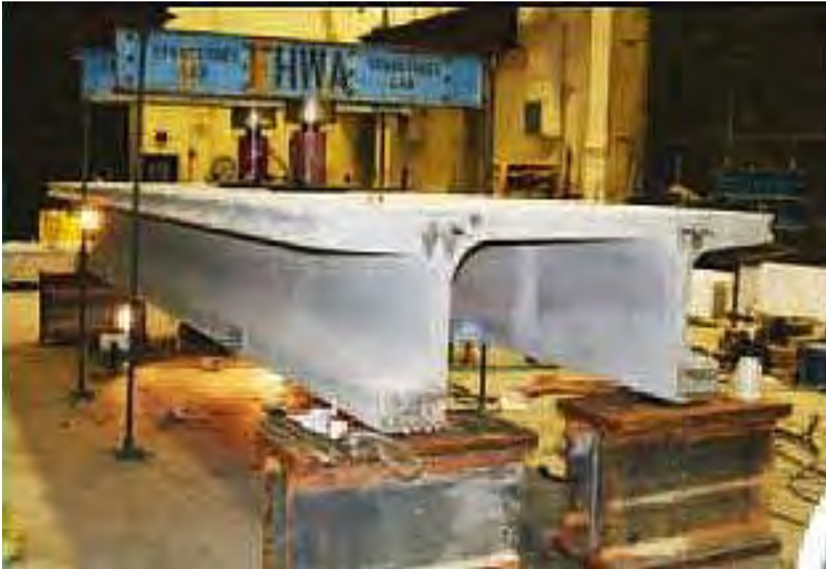
Figure 3: MIT Pi-Girder Fabricated Using RPC Proprietary Mixes (FHWA-HRT-09-069)

savings, lighter structure, and minimize the need to heavy construction equipment. The 2 nd generation Pi-girder is shown in Figure 3.