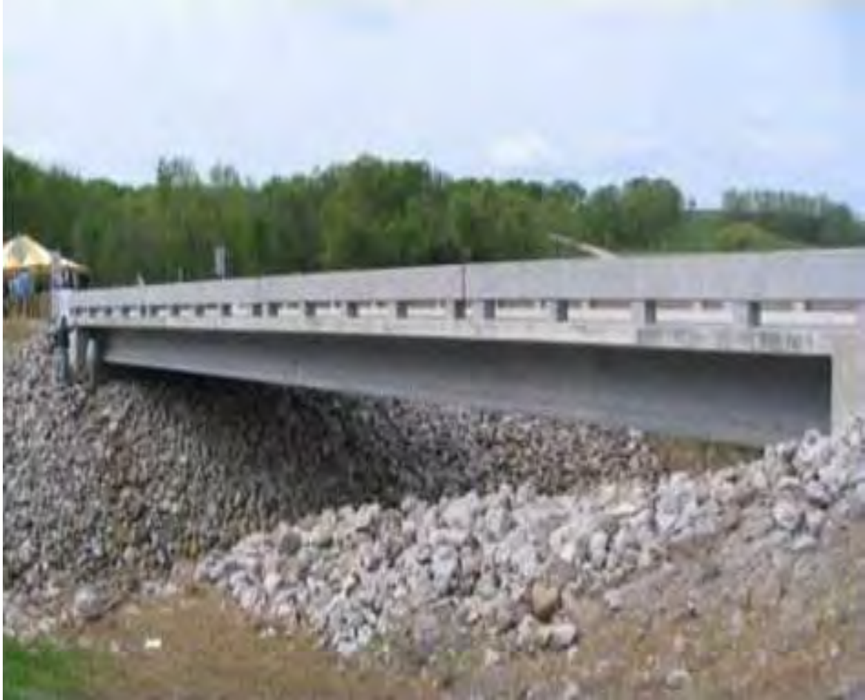
Figure 2: Mars Hill RPC Bridge Constructed in Wapello County, Iowa (Aaleti, 2011)

The success of Mars Hill RPC bridge construction encouraged researchers at the MIT to design an innovative Pi-shaped bridge girder that includes both bridge girder and bridge deck. The full-scale testing of the Pi-girder indicated a reduced torsional capacity due to the slenderness of the girder. The conclusions of this testing program suggested further optimization of the girder dimensions.